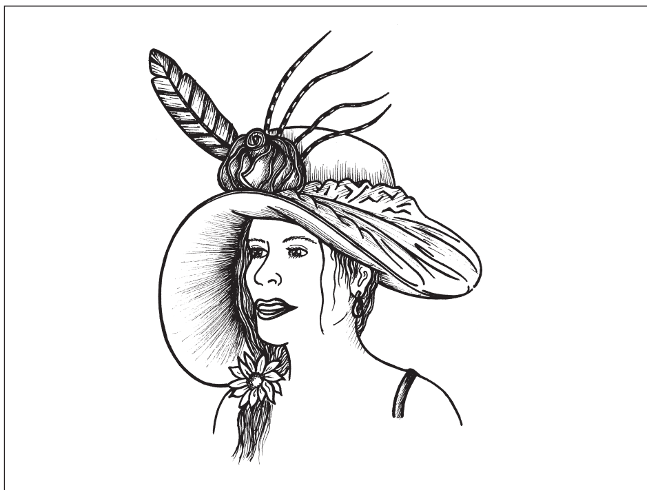
Diagram 3.1 The hat.