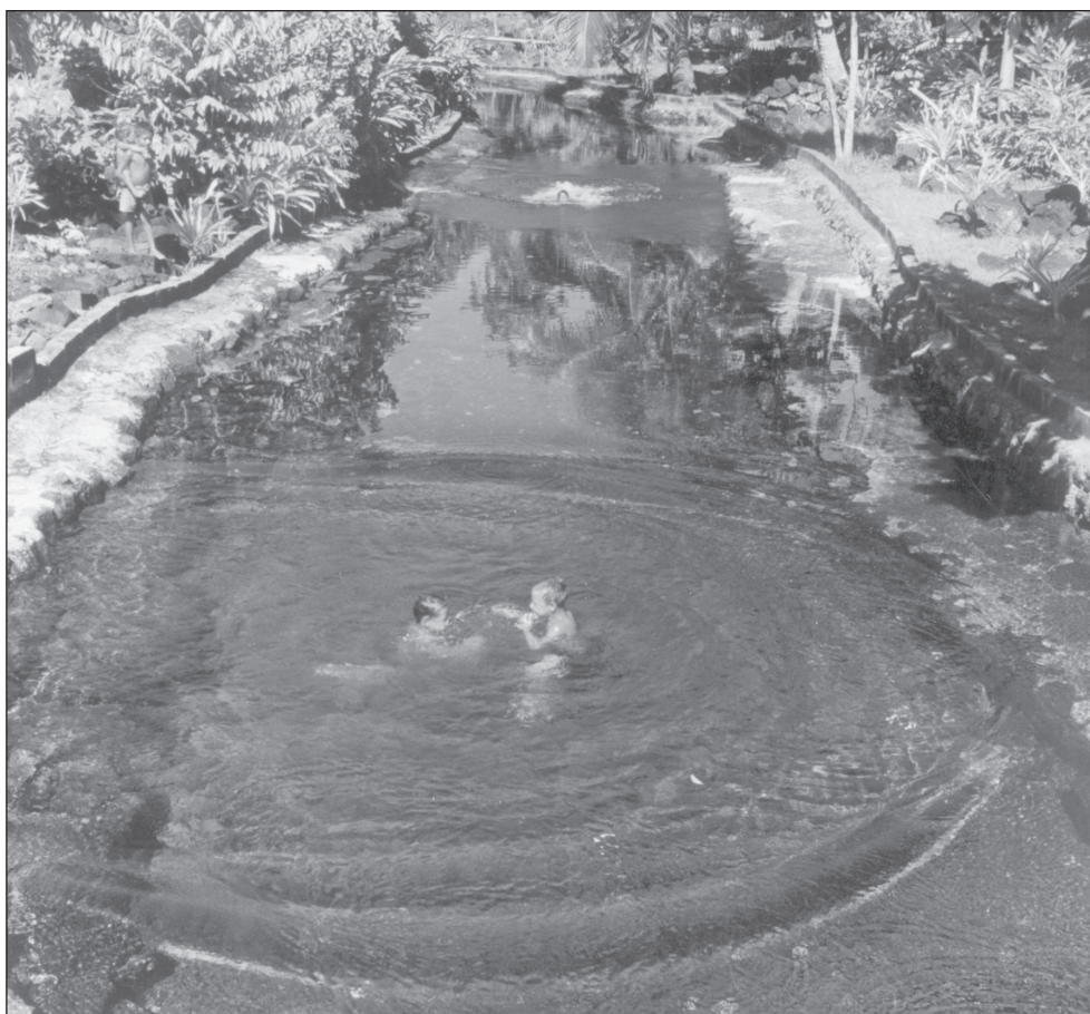
Diagram 5.1 A natural swimming pool on Savai'i.